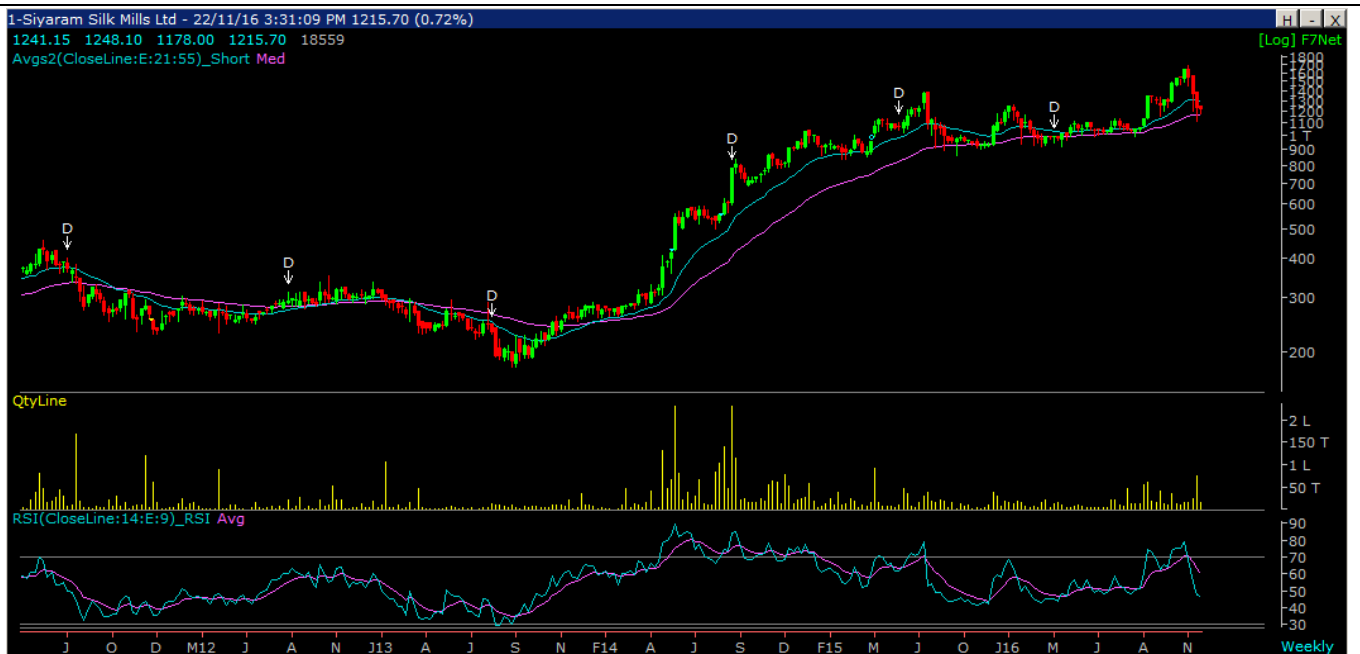
Exhibit 2: Technical Chart