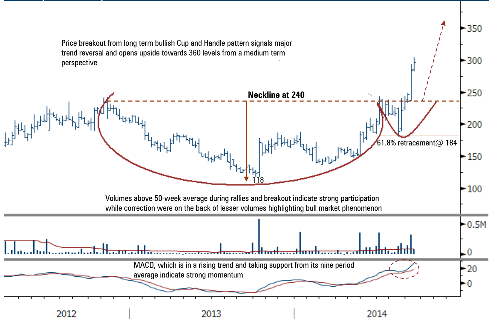
Exhibit 1: Repro India – Weekly Bar Chart